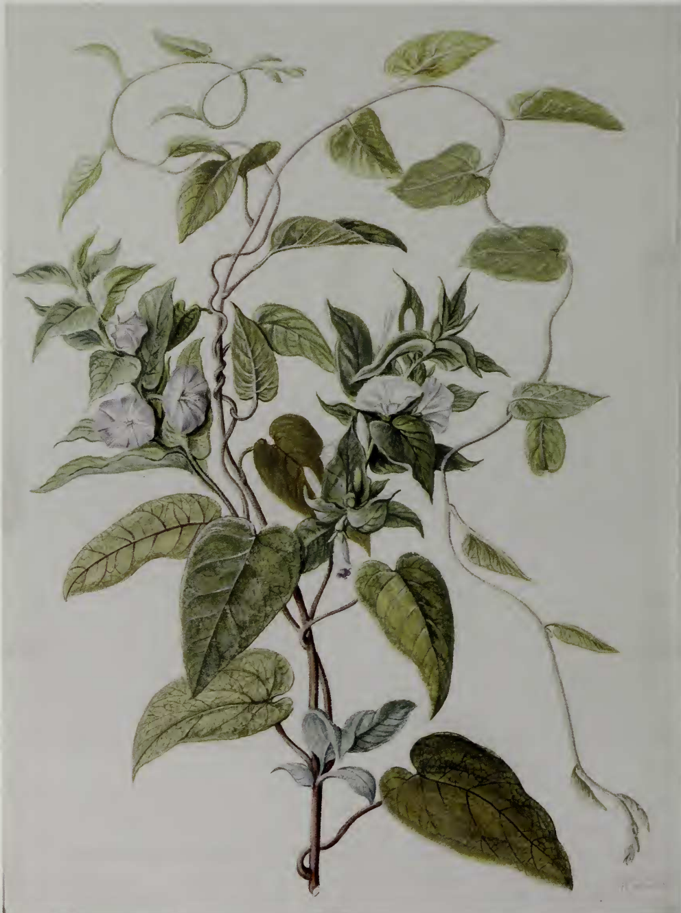
Figure 11.- Watercolor of Convolvulus canariensis located at the Moninckx Atlas (vol. 3, t. 49) made Jan Moninckx. Unknown date between 1686 and 1700.